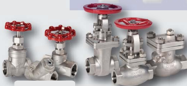
Cast Stainless Gate, Globe, Check