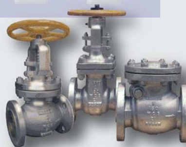
Cast Carbon Gate, Globe, Check